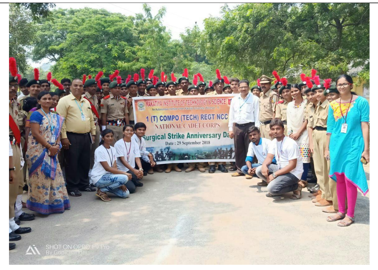
Surgical strike anniversary day