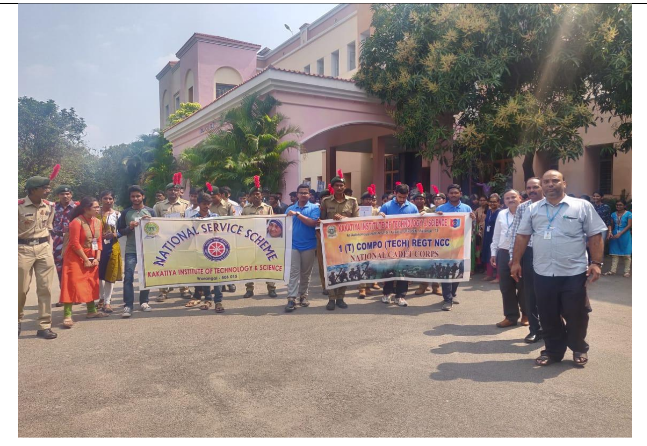
Rally conducted by cadets from KITSW-to-KITSW point