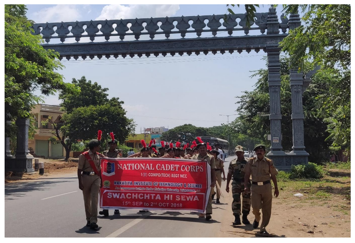
Awareness rally conducted from KITS, Warangal to Hasanparthy